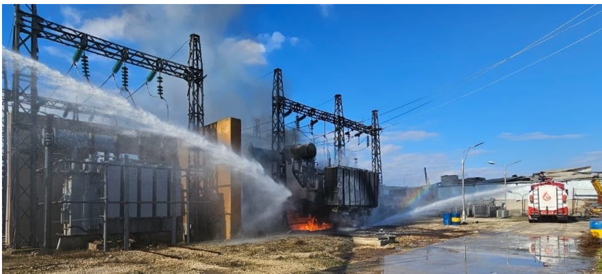
Kobane electricity station following Turkish airstrike, 14.01.2024