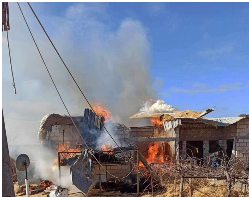
Turkish airstrike on a civilian house, Girbetli, 14.01.2024

-The SDF media center states that "these attacks have disrupted the delivery of essential services, including power, electricity, water, and other necessities, affecting hundreds of thousands of people" and claim that the attacks "constitute blatant and deliberate war crimes aimed at causing maximum harm to the lives of civilians, instilling fear, and inflicting suffering on their daily existence"